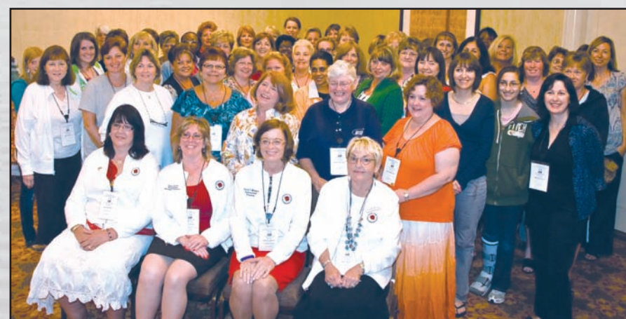
The meeting of the UTU Auxiliary at the San Francisco regional meeting was well attended.