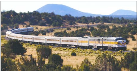
The Grand Canyon Railway

Landfall Travel can also help arrange lodging and other amenities in the days before departure from Phoenix or after in Las Vegas.