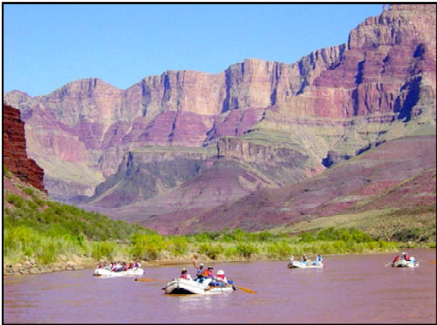
Rafting through the Grand Canyon

The price includes seven breakfasts and three three-course dinners, as well as airport transfers, hotel taxes, tips for baggage handling and a sight-seeing program.